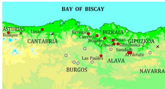
Figure 1 – Caves sampled for Zospeum in northern Spain

Red circle indicates caves explored (June 2011) containing Zospeum populations; X indicates caves explored (June 2011) not containing Zospeum populations; White circle indicates caves known to contain Zospeum populations but not sampled on this excursion.