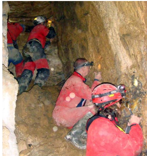
Figure 4 – Zospeum hunt in June 2011

It is presumed that the populations in Cueva Arrikruz and Cueva de Las Paúles were most likely able to sustain themselves as colonies for many generations due to continuous, consistent environmental conditions such as temperature, humidity, airflow, water levels and the influx of organic material. Moreover, the patched fungal colonies associated with these populations may well serve as a food source or even comprise a symbiotic relationship in respect to the breakdown of fecal matter and the metabolic processes enabling the colonization of these minute snails. These pivotal findings enable new insights concerning their characteristic ellobioid colonization in mud and their adaptation to a troglobitic ecology.